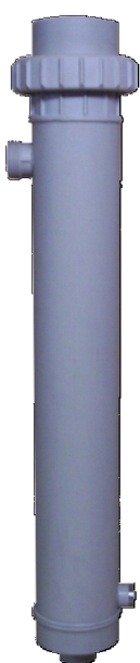
PP and PVDF single cartridge housing up to 1 x 40" cartridge, DOE, M7 or M3 connection.

For chemical applications both polypropylene and PVDF are recommended. PVDF can handle temperatures up to 140 degr. C.