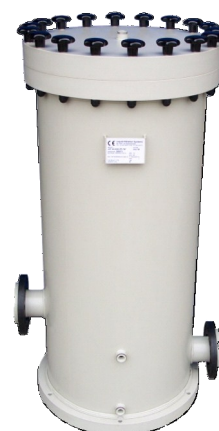
Type JCF-2275, suitable for 22 cartridges of 30" length.

We manufacture housings up to 120 x 40" cartridges and 14x size 2 filter bags. Standard operating pressure 6 bar. Higher working pressures are available on demand.