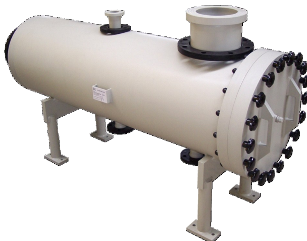
Horizontal filterunit. Unit can be made to accept 3 high flow filter cartridges (DPU-PSB-3M)

The filter housings are suitable for all liquids and gases classified as group 2 and all liquids in group 1 except for those classified as oxidising or explosive. The groups are defined in the European Pressure Equipment Directive 97/23/EC.